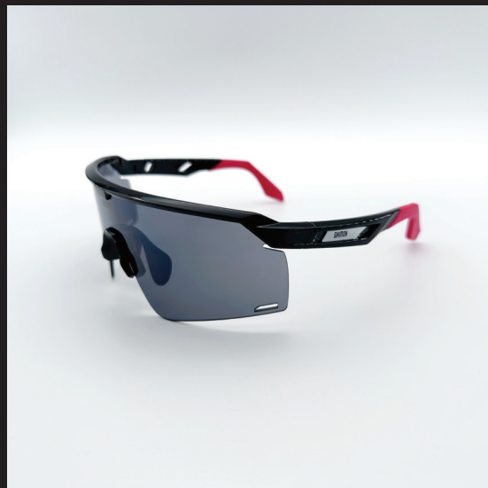
MODEL: KC 0101 C3 Price: £105.00