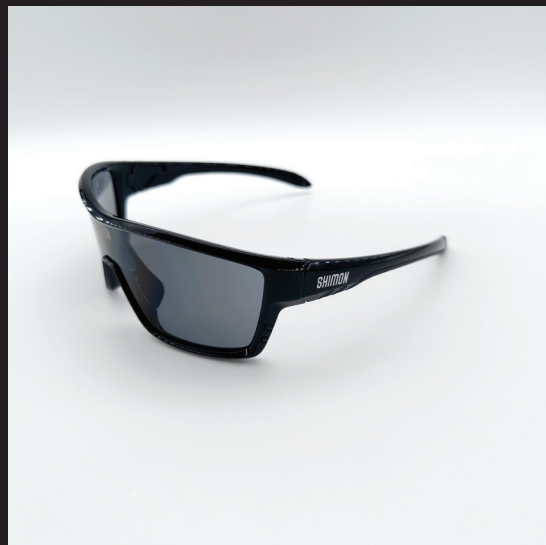
MODEL: JDSY 134 C1 Price: £105.00