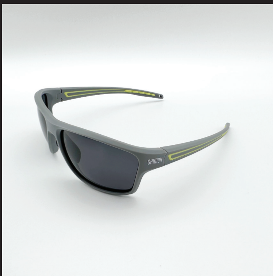
MODEL: KA 101 C8 Price: £105.00