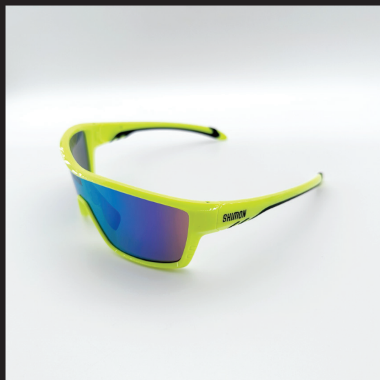
MODEL: JDSY 134 C4 Price: £105.00