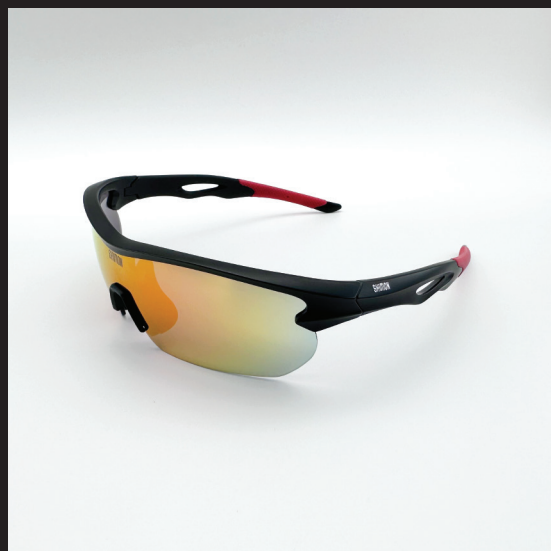
MODEL: JDSY 028 C2 Price: £105.00