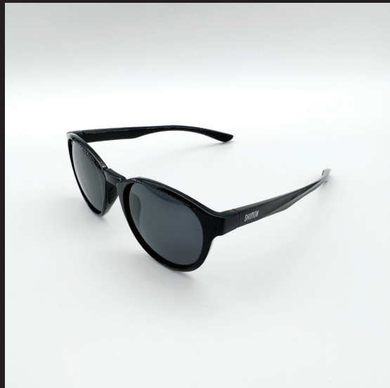
MODEL: KB 0101 C1 Price: £105.00