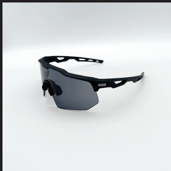
MODEL: JDSY 131 C1 Price: £45.00