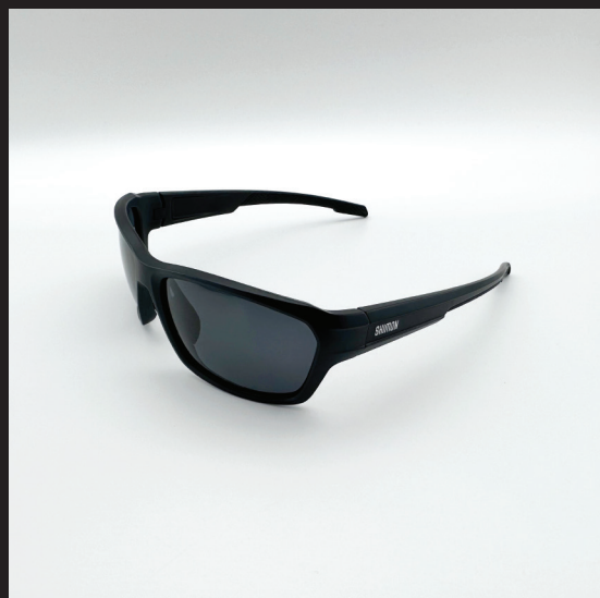
MODEL: KA 0203 C1 Price: £105.00