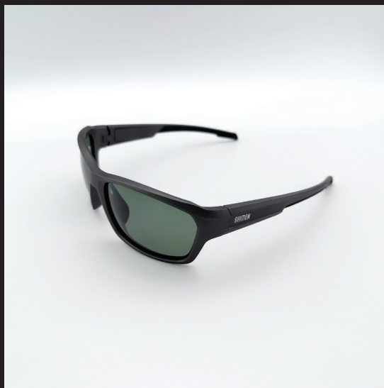
MODEL: KA 0203 C10 Price: £105.00