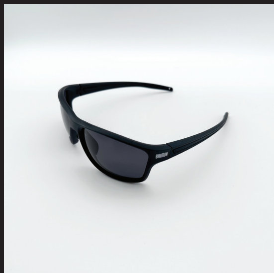
MODEL: KA 101 C1 Price: £105.00