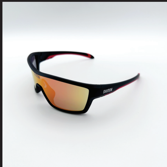
MODEL: JDSY 134 C2 Price: £45.00