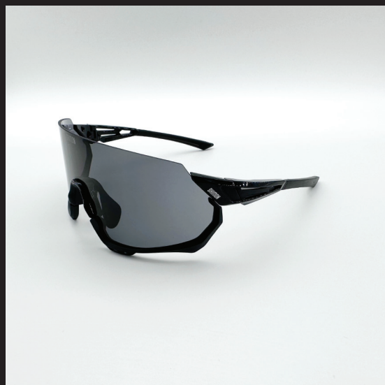
MODEL: KC 0204 C1 Price: £105.00