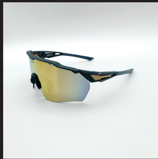
MODEL: KC 0203 C5 Price: £45.00