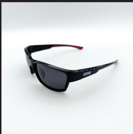
MODEL: KA 0306 C5 Price: £45.00