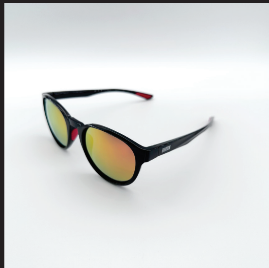
MODEL: KB 0101 C2 Price: £105.00