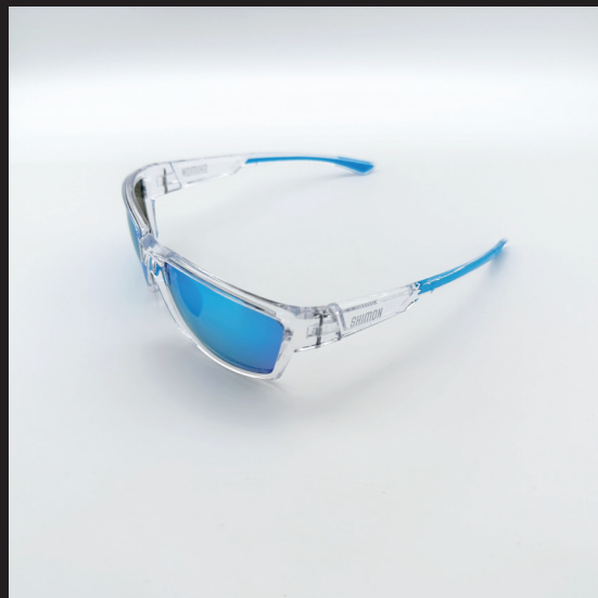
MODEL: KA 0306 C7 Price: £45.00