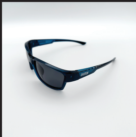
MODEL: KA 0306 C6 Price: £45.00