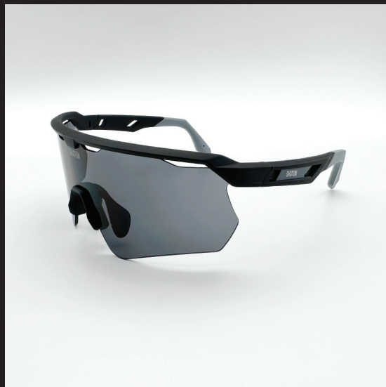
MODEL: KC 0102 C1 Price: £105.00