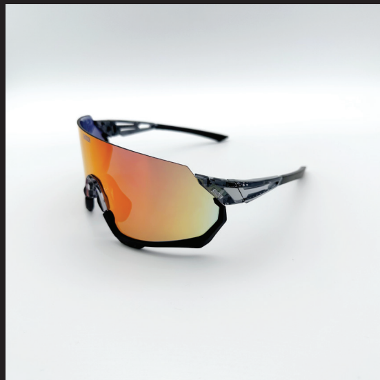
MODEL: KC 0204 C2 Price: £105.00