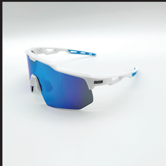
MODEL: JDSY 131 C3 Price: £45.00