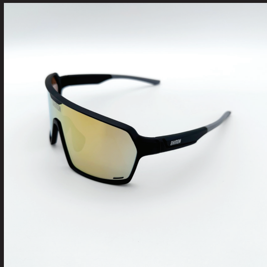
MODEL: JDSY 180 C2 Price: £105.00