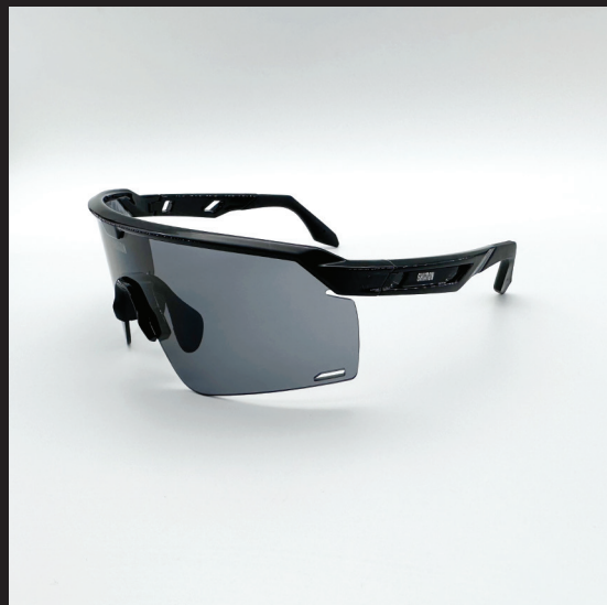
MODEL: KC 0101 C1 Price: £105.00