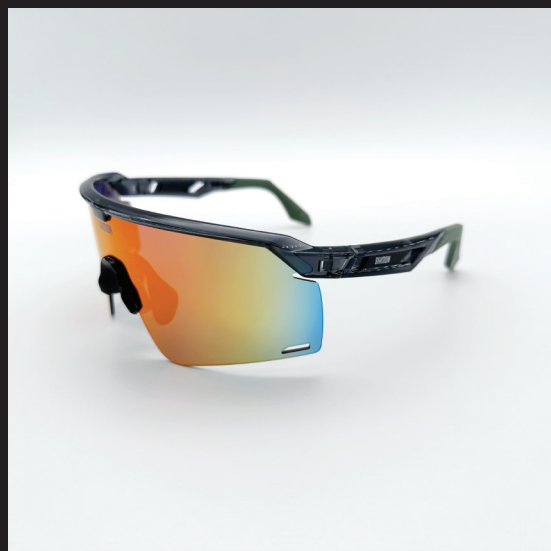
MODEL: KC 0101 C4 Price: £105.00