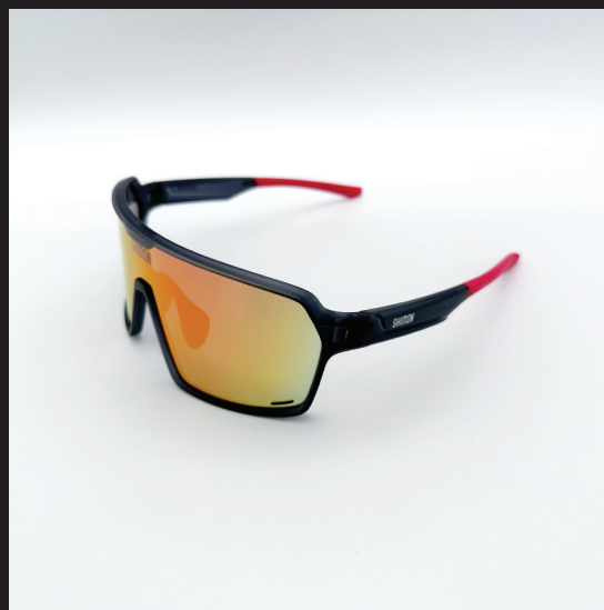
MODEL: JDSY 180 C3 Price: £105.00