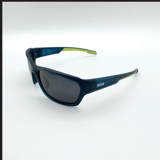
MODEL: KA 0203 C6 Price: £105.00