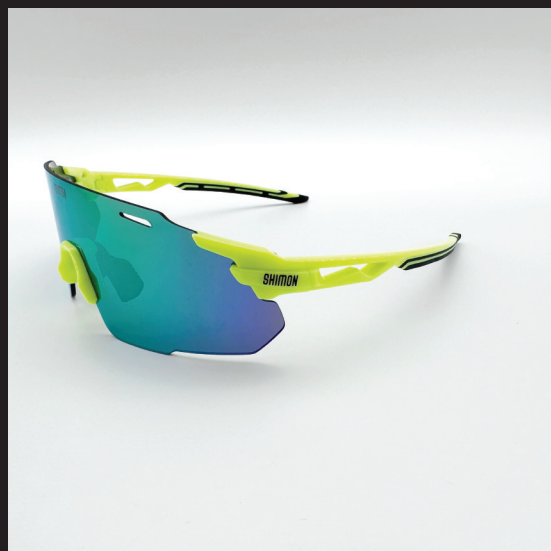
MODEL: JDSY 127 C3 Price: £105.00