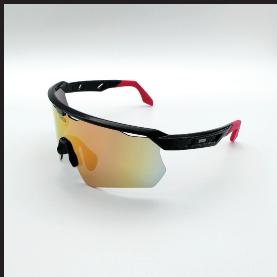
MODEL: KC 0102 C2 Price: £105.00