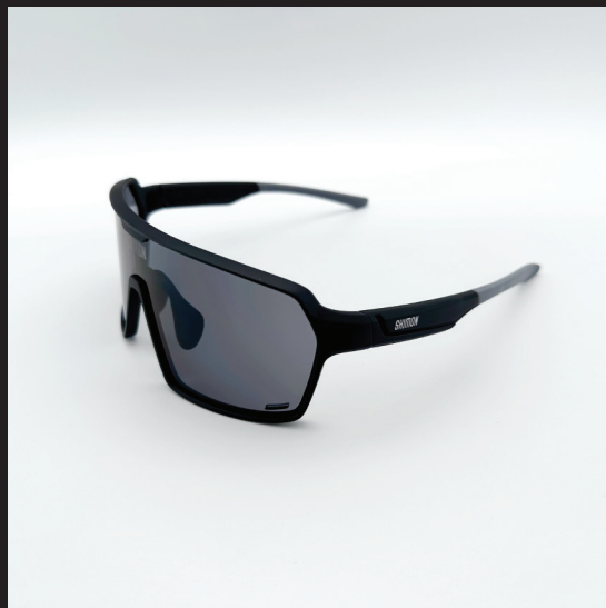
MODEL: JDSY 180 C1 Price: £105.00