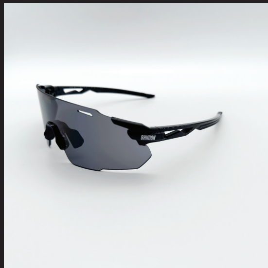
MODEL: JDSY 127 C1 Price: £105.00