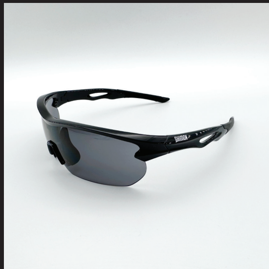
MODEL: JDSY 028 C1 Price: £105.00