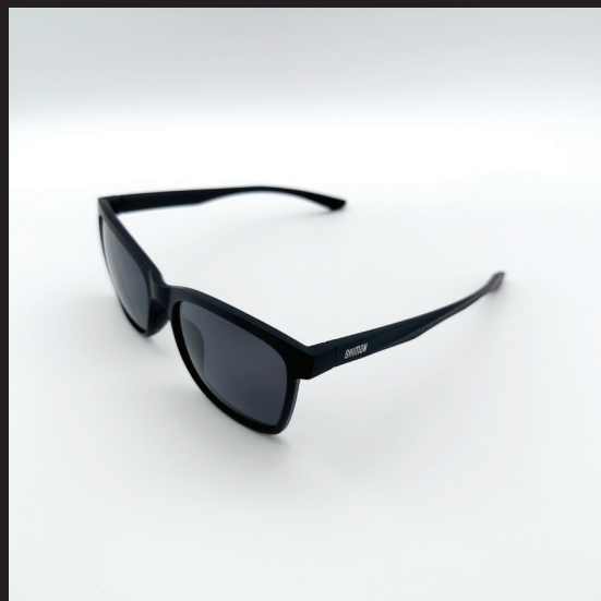
MODEL: KB 0102 C2 Price: £45.00