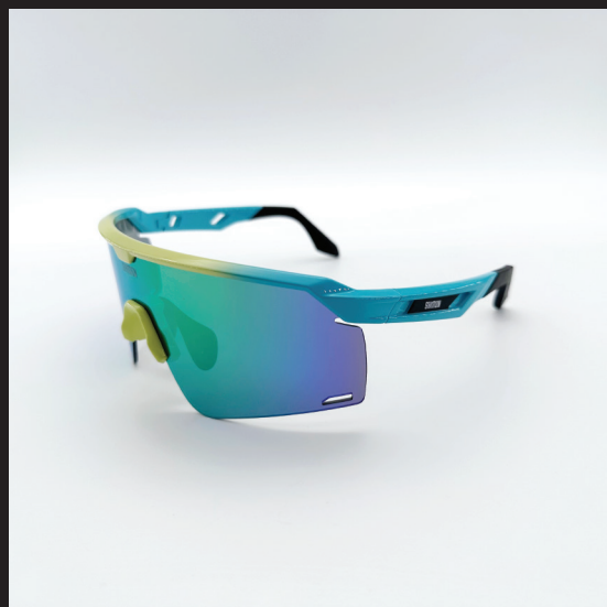
MODEL: KC 0101 C6 Price: £105.00