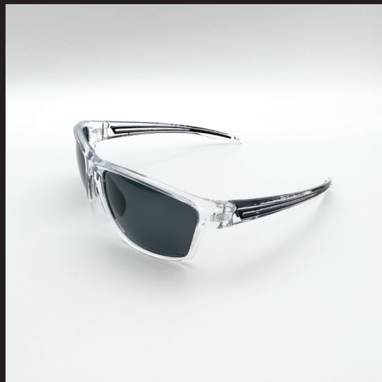
MODEL: KA 101 C10 Price: £105.00